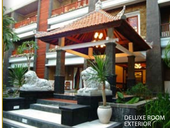
DELUXE ROOM EXTERIOR

American Express, Visa, MasterCard, Diners Club