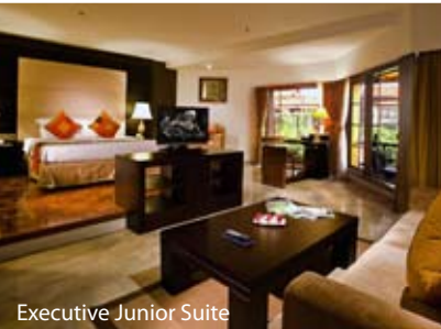
Executive Junior Suite